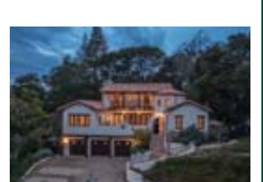
25 Southwood Dr 4+/4.5 4011 Sq Ft** .3 Ac** A Gem Near Town Branagh Built 2014 25SouthwoodDr.com